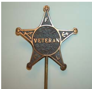
State Bronze Star Marker

Markers for the period ending 5/31/2010 were distributed during the fall of 2010 so everyone should already have the markers to place for Memorial Day 2011. Once the markers are actually received, we will send out specific ordering instructions to all CVSOs for future orders.