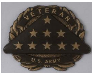
VA Bronze Medallion