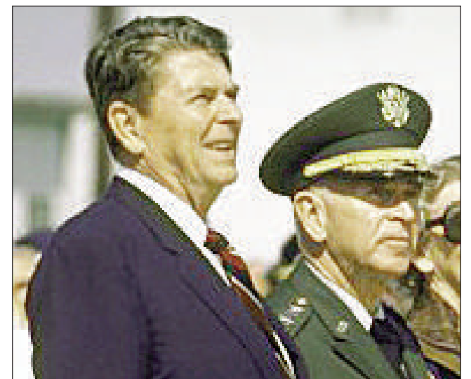
Vessey was appointed by President Ronald Reagan.