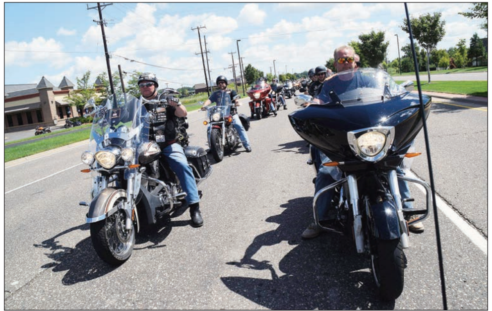
LEGACY RUN 2016 -- American Legion Riders stretch out into the distance near Forest Lake on this year's Legacy Run. The North and Not So North runs raised money for the Scholarship Fund that will be presented at national convention.