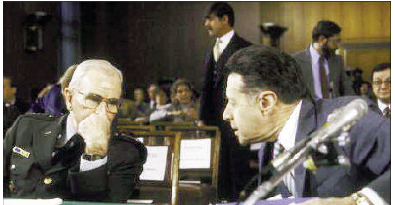
TESTIFYING -- Chairman of the Joint Chiefs of Staff John Vessey confers with Secretary of Defense Casper Weinberger during Congressional hearings.